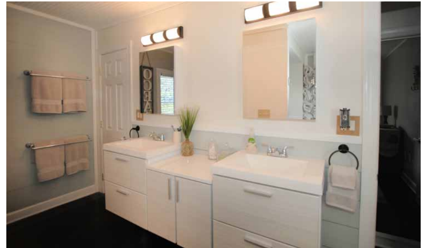
Second Floor Owner's Suite