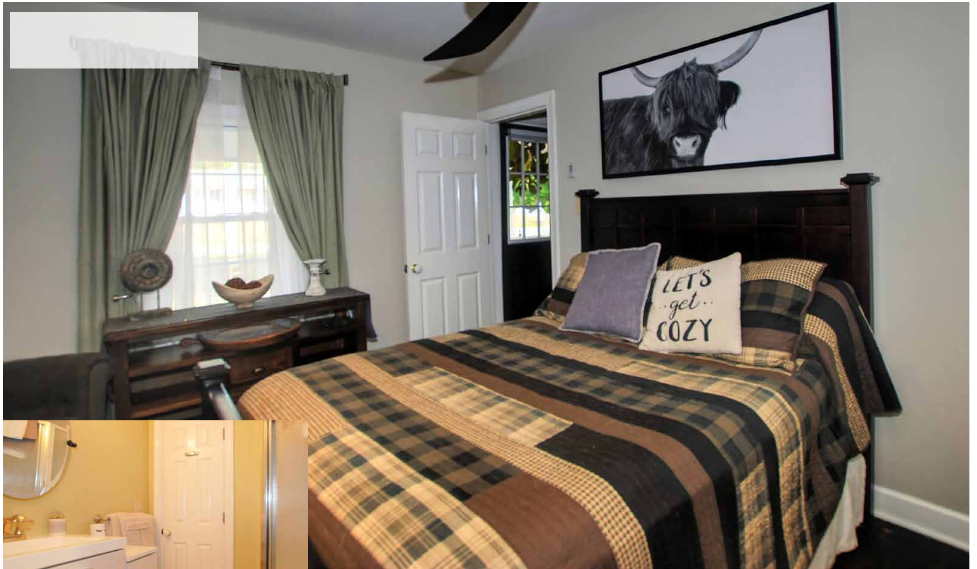
First Floor Bedroom and Bathroom